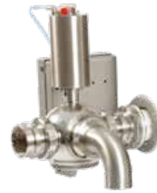
Reject Valve Example: Three-way Ball Valve

There are a number of different fully integrated high-speed reject valves available. The correct choice depends on a number of factors such as type of environment, product speed and product type. Reject valves can be synchronised to the pump, minimising the rejected portions.